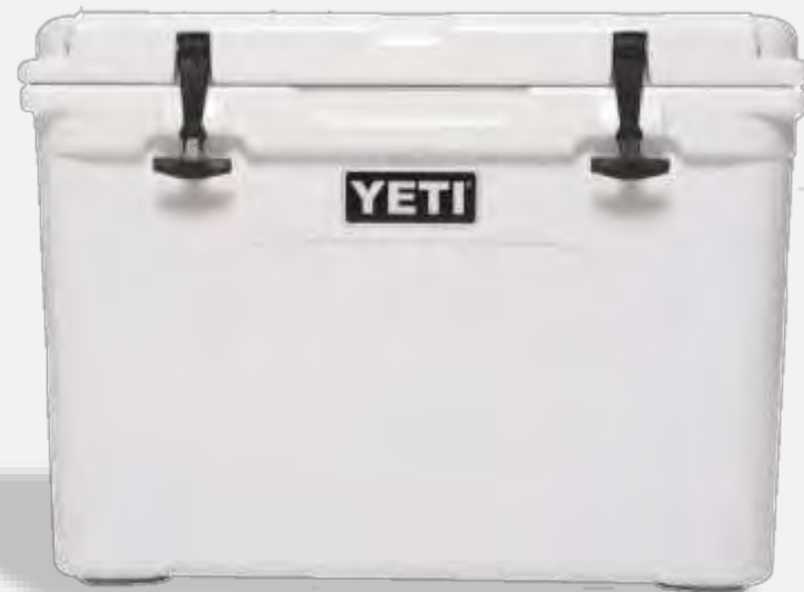
TUNDRA® 50 $379.99