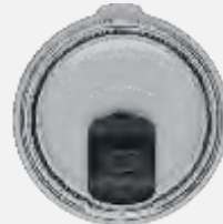
Magnet Slider Lid

YETI®'s laser marking process is guaranteed through the life of the product no scratching or fading. Add a custom design to any member of our stainless steel drinking vessels to make your YETI® customized.