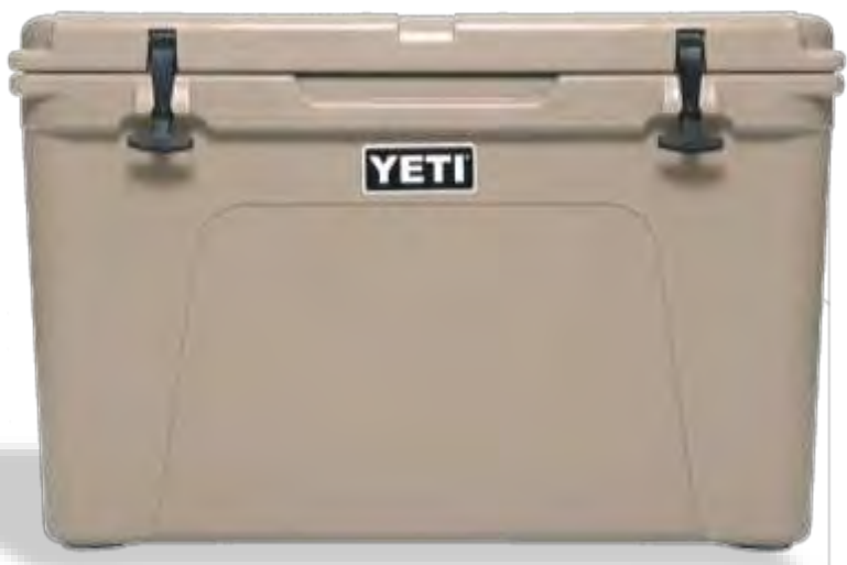
YT105W (white) YT105T (tan)