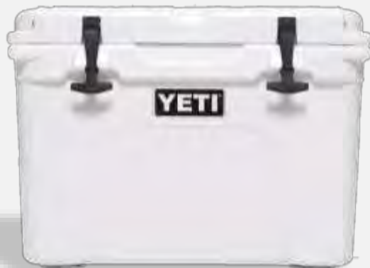
TUNDRA® 45 $349.99