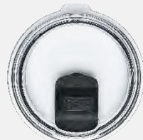
Magnet Slider Lid

YETI®'s laser marking process is guaranteed through the life of the product no scratching or fading. Add a custom design to any member of our stainless steel drinking vessels to make your YETI® customized.